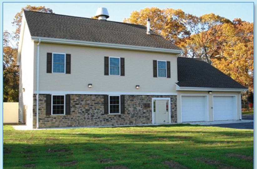
South Huntington new well site and treatment facility.

Well, actually, it's your Water District. Here at South Huntington, we want our many vital facilities to blend into the surrounding areas, causing the least amount of disruption to our friends and neighbors. This new well site and treatment facility was purposely built with a residential facade to reflect the suburban neighborhood in which it resides.