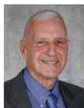
Commissioner Joseph Perry

Always Call Before You Dig! Long Island is more crowded today...on the roads, in shopping malls and underground. Underground? Yes!